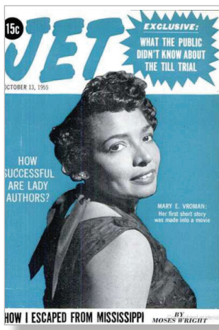
A JET cover from October 13, 1955.