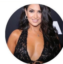
Rama Montakhabi Actress (Starz' 'BMF')