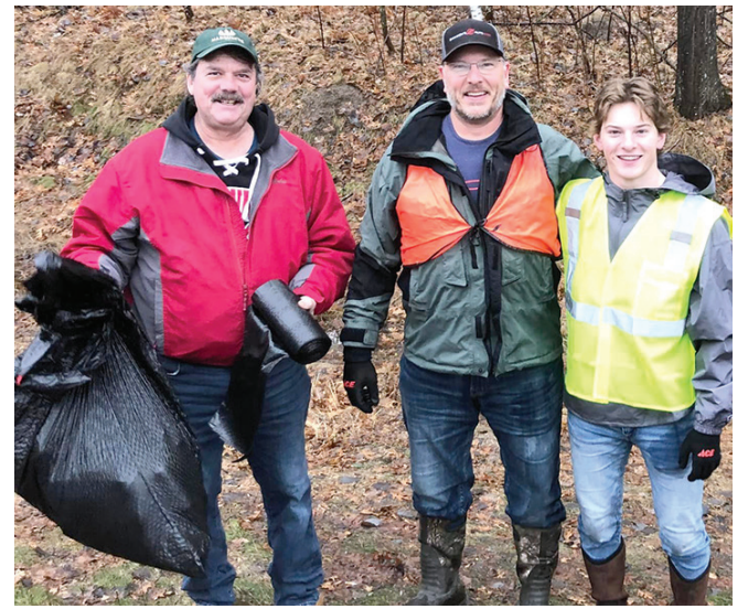
Volunteers from Pelican Lake Conservation Club cleaned up about six miles around Pelican Lake April 23, 2022.