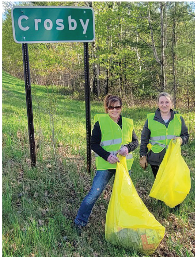
Volunteers from Unity Bank in Crosby picked up along CR 31 May 25, 2022.

The Crow Wing County Highway Department is starting the third year of the Pick A Mile Program. The program was rolled out in June 2021 for residents to pick a mile of county roads to assist in roadside cleanup. An easy-to-use app allows residents to reserve an available stretch of road to cleanup as a family, business, or organization. The program also brings a sense of pride and ownership to county roads.