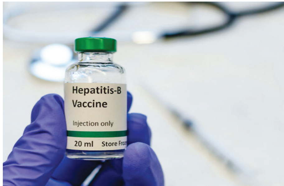
As many as 2.4 million people are living with hepatitis B, according to the CDC.

Even though the number of people with HBV has decreased significantly in the last 30 years, the Office of Minority Health at the U.S. Department of Health