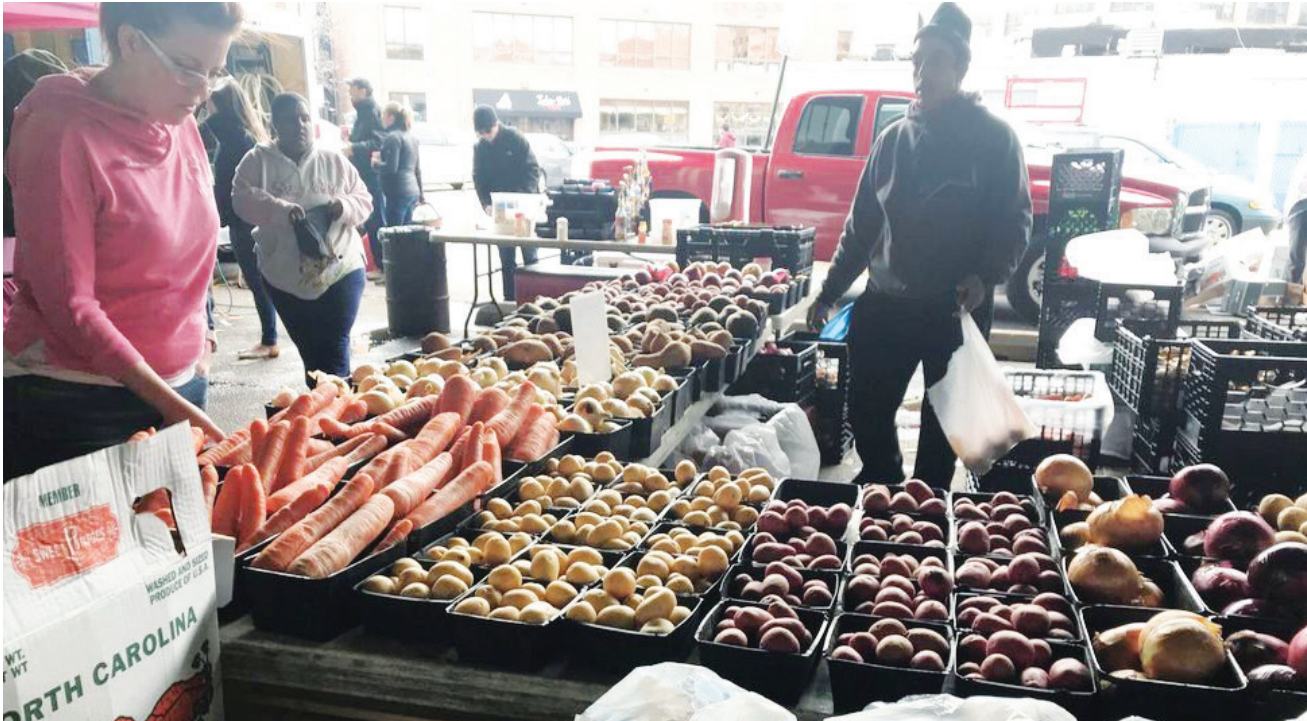
Baltimore Farmers' Market has fresh produce. File photo