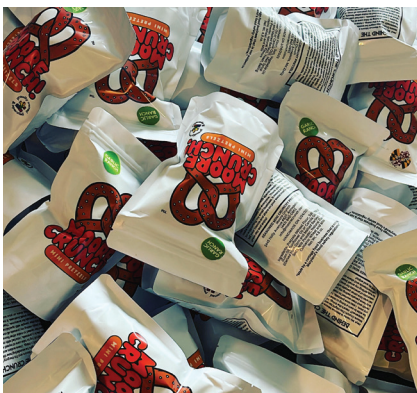
Bags of Moore Crunch