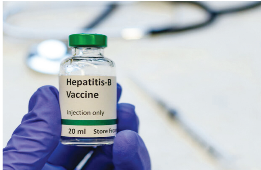
As many as 2.4 million people are living with hepatitis B, according to the CDC.

Even though the number of people with HBV has decreased significantly in the last 30 years, the Office of Minority Health at the U.S. Department of Health