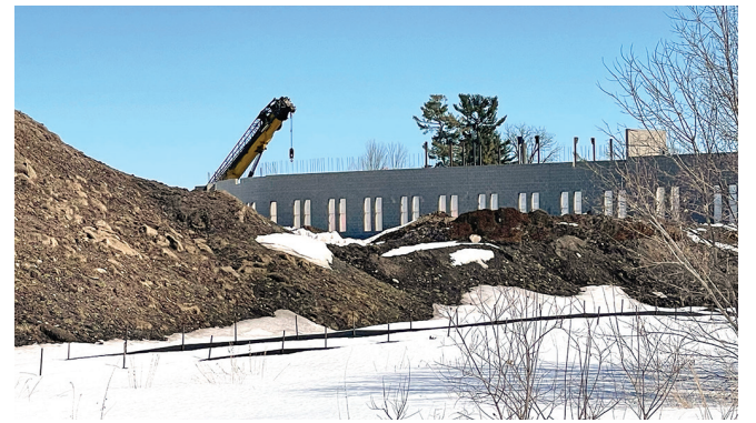
Work is progressing quickly on the new Riverwood Healthcare Center surgery addition in southeast Aitkin. Passers-by have noticed a huge mountain of fill, hereby dubbed Mount Riverwood, and an active crane at the site installing walls.

Attire is dressy casual with Derby hats for men and women optional. For tickets, sponsorship and donations in queries, contact Riverwood Foundation at (218) 927-8286 or e-mail peklund-fisher@rwhealth.org