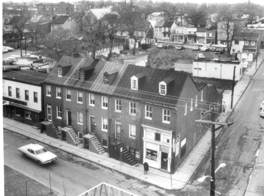
The Old 4th Ward in Annapolis, prior to the parking garage being built.

She added that urban renewal caused a surge of public housing in Annapolis because of people being forced to move from their homesteads and having to find a place to live. Along the way, a parking garage for Anne Arundel County employees was added on some of the land. A park that was “nothing” drew homelessness and