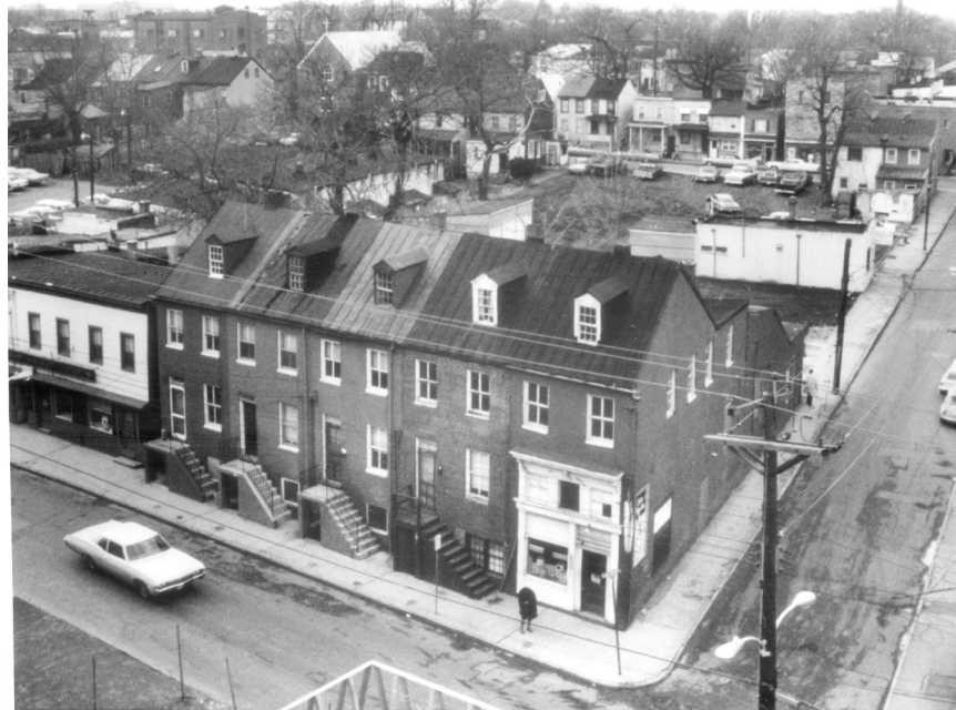
The Old 4th Ward in Annapolis, prior to the parking garage being built.

She added that urban renewal caused a surge of public housing in Annapolis because of people being forced to move from their homesteads and having to find a place to live. Along the way, a parking garage for Anne Arundel County employees was added on some of the land. A park that was “nothing” drew homelessness and