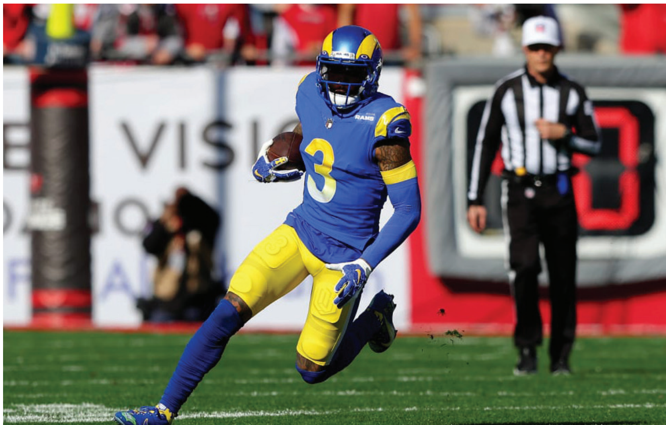
Odell Beckham Jr.

A complete list of opportunities to volunteer with JVC on Good Deeds Day is available online via https://jvcbaltimore.org/annualevents/good-deeds-day/ . Registration must be completed by 11:59 p.m. on Sunday, April 9, 2023. Inquiries about partnering to help the community can be established by emailing info@jewishconnect.org .