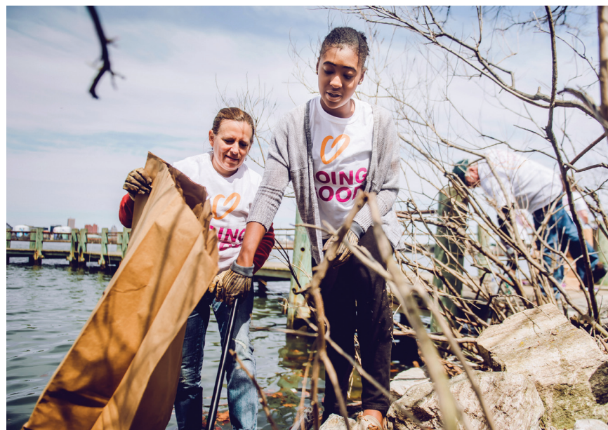
Volunteers help to clean up a local park.

“We partner with several nonprofits in Baltimore. Very few of them are