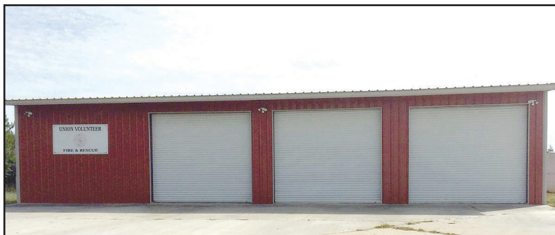
The new Moselle VFD fire station will be built on the same floor plan as the newly constructed Union VFD fire station pictured above.

Construction of the 4,900 square foot metal building should begin immediately, and is expected to be completed by the first or second week in January. The contract for the construction of the $150,000 building was awarded to Complete Construction Contractors of Hattiesburg. Funding for the new building will come from the Moselle VFD's existing account, and a loan granted to the department from the Jones County Fire Council.