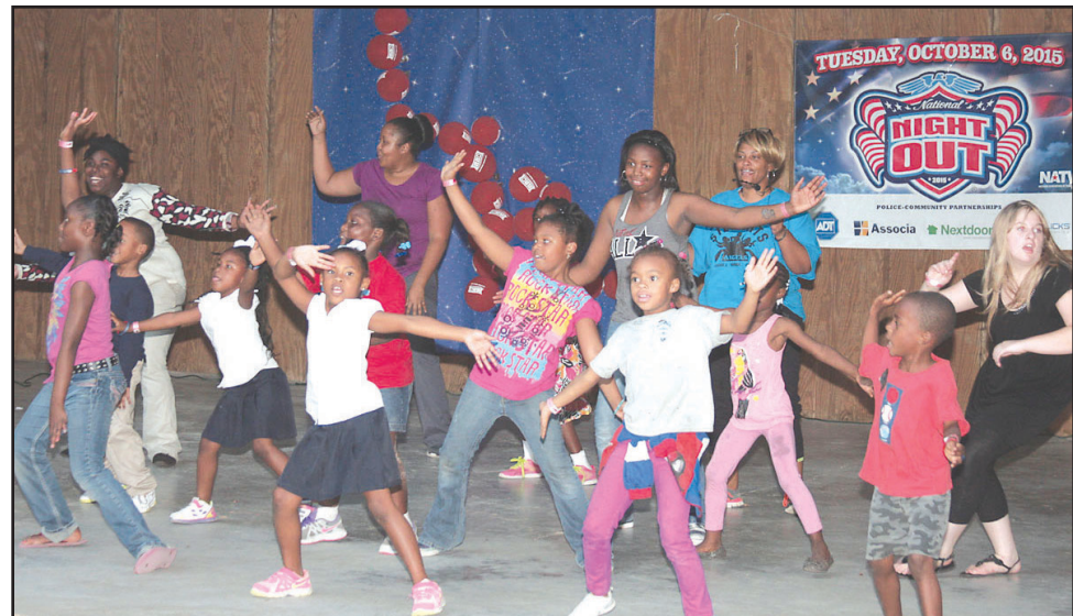
Whip and Nae Nae