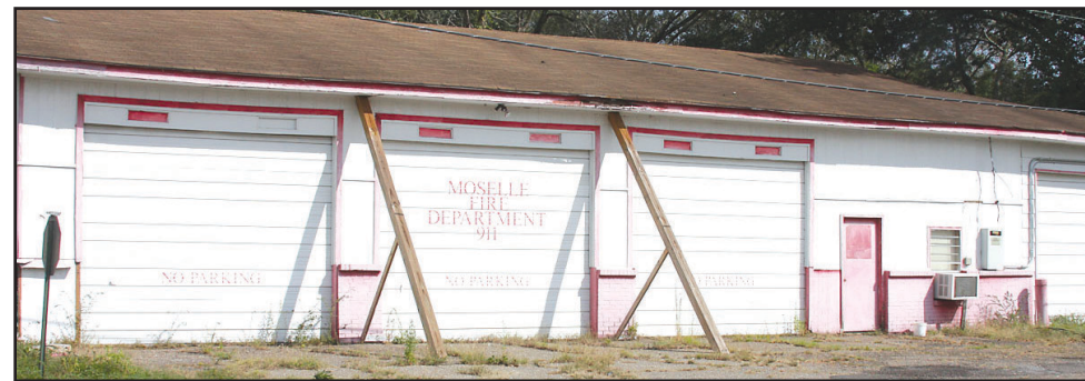
To keep the old Moselle fire station from falling down, 8x8 braces are used to shore up the old building.