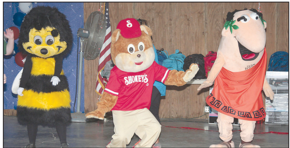
B-95 Buzzy, Shoney Bear, and Little Caesar join in the Whip and Nae Nae.