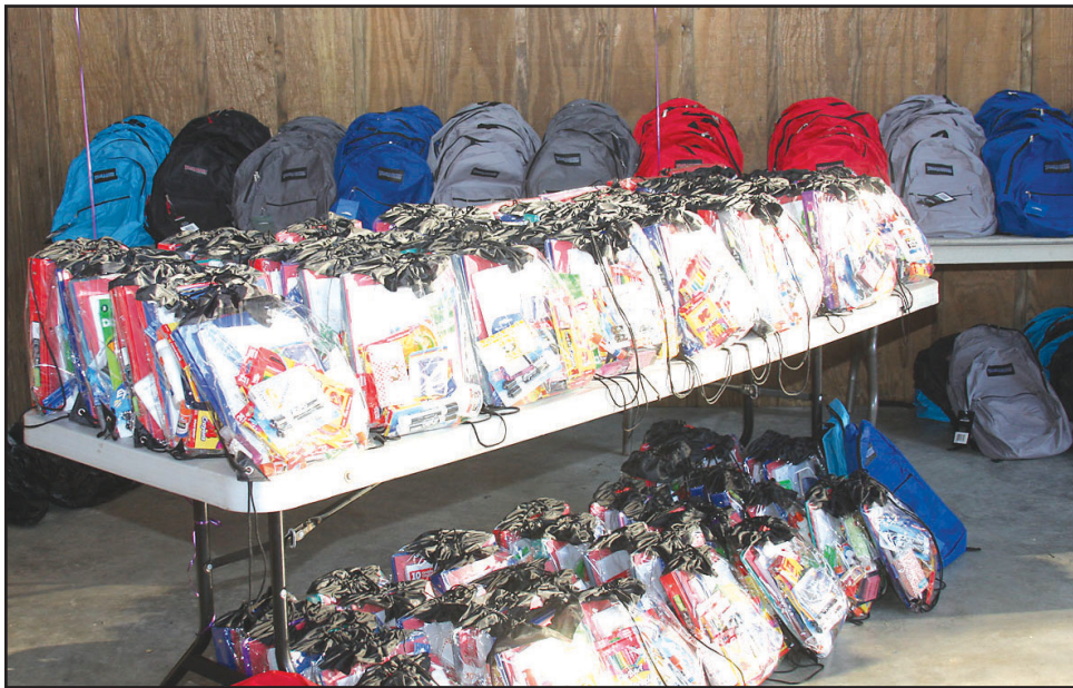
Over 500 backpacks were given away at LPD's Night Out Against Crime.