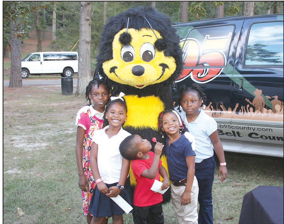
The kids flocked to Buzzy with B-95.