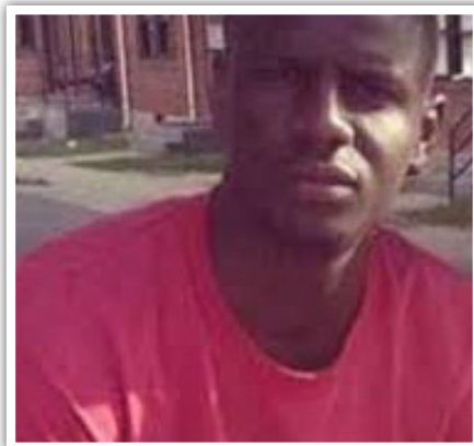
Freddie Gray

My professional relationship with The Baltimore Times began in 1996. As a child, if anyone asked me what I