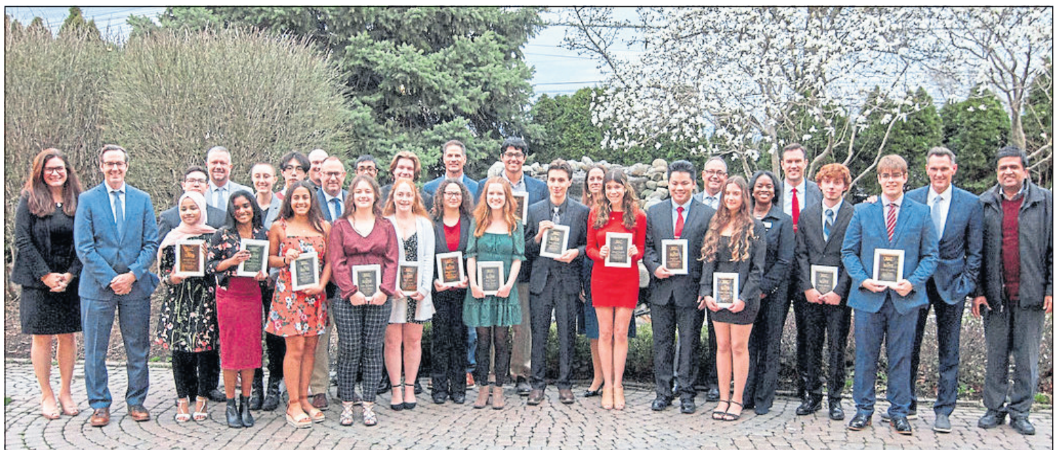
The 2022 Macomb County All-Academic Dream Team is pictured at last year's ceremony.

First started in 1986 by The Macomb Daily and the Macomb County Principals Association, the annual Macomb County All Academic Banquet is held in April every year and is now run by the principals association and the Macomb Intermediate School District. The event returned last year after a 2-year hiatus in which students were recognized virtually due to the COVID-19 pandemic. This year's event is being held Tuesday, April 18 at The Mirage Banquet Hall in Clinton Township.