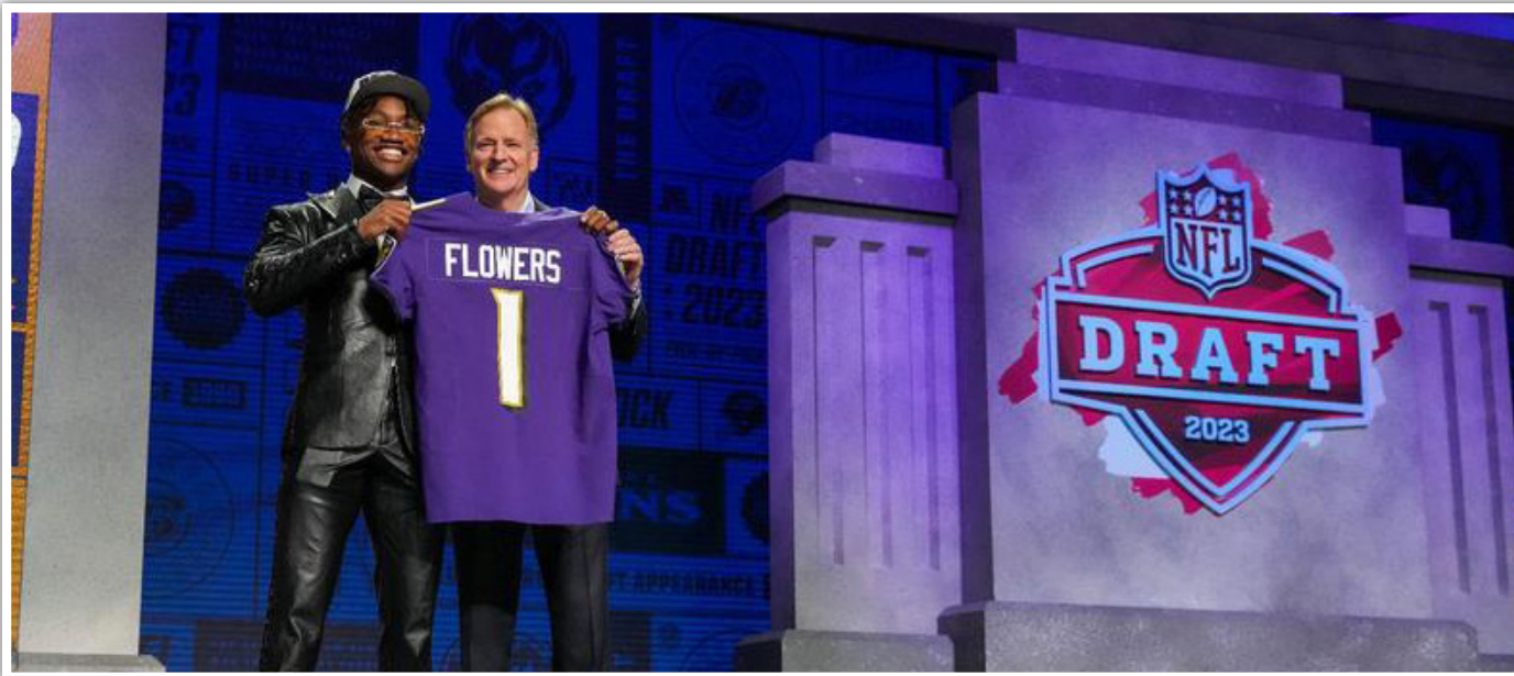
Zay Flowers and NFL commissioner Roger Goodell