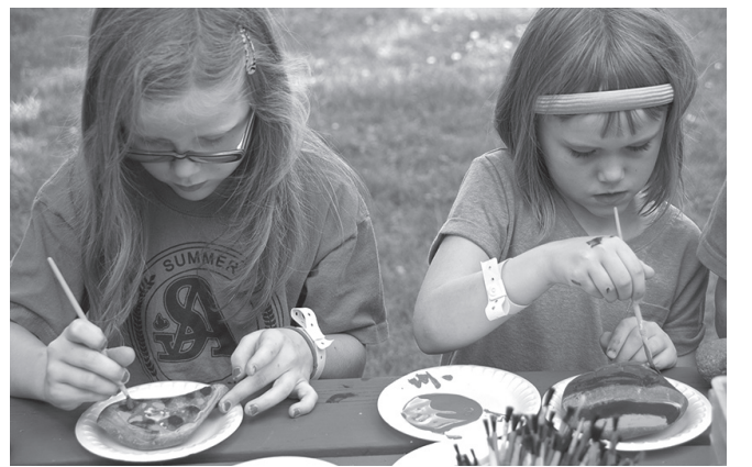
Clearwater Forest Camp and Retreat Center offers day camp options for 5-12 year olds.