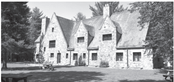
Built in 1924 by John Savage, Eagle Lodge is a stately English stone manor home on the edge of Clearwater Lake that boasts nine bedrooms, seven bathrooms, a dining room that seats 25 and two glass-enclosed heated porches.

By ANN SCHWARTZ Nestled deep in the forest of 1,000 acres, Clearwater Forest Camp and Retreat Center is a hidden gem in the Bay Lake area. It features over three miles of shoreline on the 900-acre, 50-foot-deep Clearwater Lake.