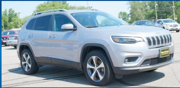
2019 JEEP CHEROKEE LIMITED