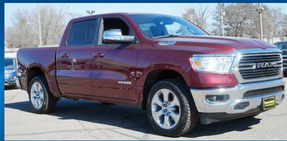
2021 RAM 1500 BIG HORN CREW