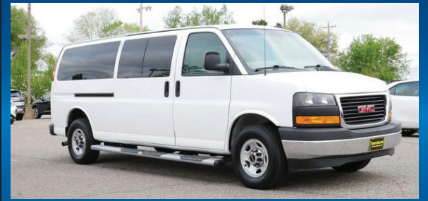
2017 GMC SAVANA PASSENGER VAN LT