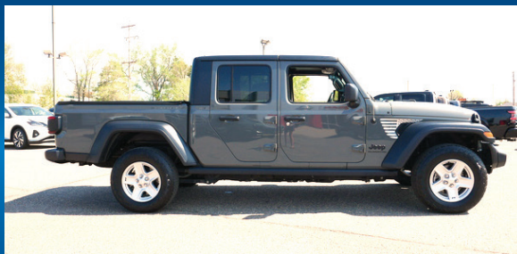
2020 JEEP GLADIATOR SPORT S