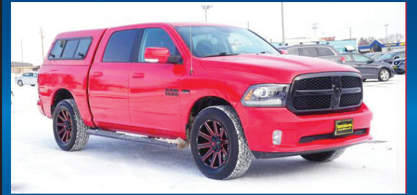
2018 RAM 1500 NIGHT EDITION