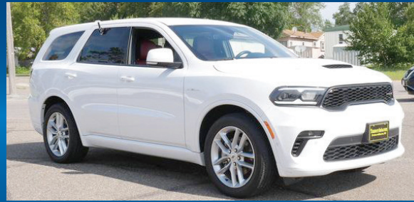
2021 DODGE DURANGO R/T