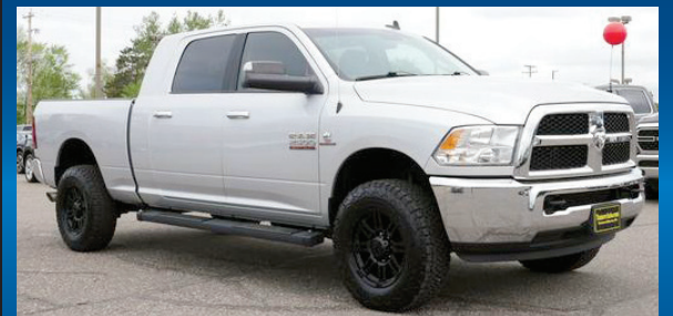
2018 RAM 2500 MEGA CAB DIESEL