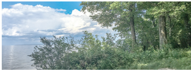
Forested shoreline on Mille Lacs Lake.