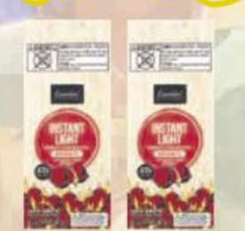
Essential Everyday Instant Light Charcoal Briquets 6.2 lb. bag