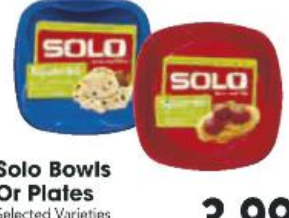
Solo Bowls Or Plates Selected Varieties 15-22 ct. pkg.