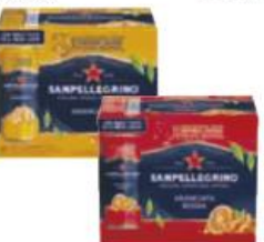
SanPellegrino Italian Sparkling Drinks Selected Varieties 6 pk. 11.15 oz. cans