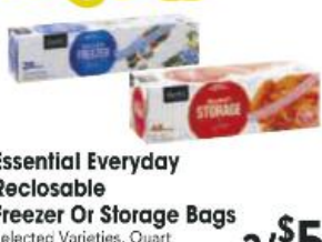
Essential Everyday Reclosable Freezer Or Storage Bags Selected Varieties, Quart Or Gallon - 28-48 ct. box