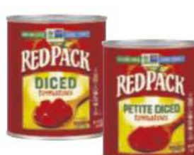
RedPack Tomatoes Selected Varieties 28-29 oz. can