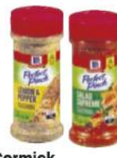
McCormick Perfect Pinch Seasonings Selected Varieties 1.31-7 oz. ctn.