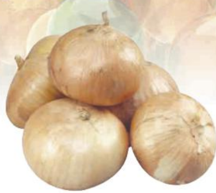
Jumbo Vidalia Onions