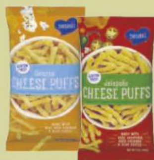
Barbara's Cheese Puffs Selected Varieties 5.5-7 oz. bag