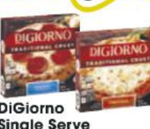
DiGiorno Single Serve Pizza Selected Varieties 8.2-10 oz. box