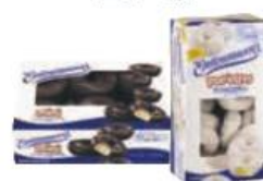
Entenmann's Donuts, Pop'ems Or Pop'ettes Selected Varieties - 16 oz. pkg.