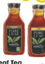
Lipton Pure Leaf Tea Selected Varieties 59 oz. btl.