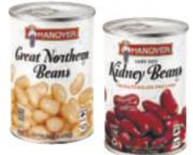
Hanover Beans Or Peas Selected Varieties 15.5 oz. can