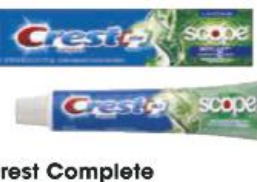
Crest Complete Toothpaste Selected Varieties 5.4 oz. pkg.