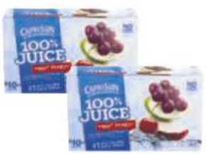
Capri Sun 100% Juice Drinks Fruit Punch 10 pk. 6 oz. pouches