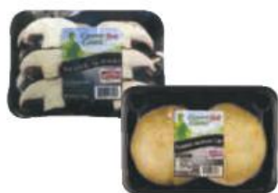
Green Giant Portabella Mushrooms Caps Or Slices - 6 oz. pkg.