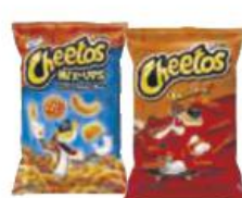
Cheetos Snacks Selected Varieties - 7-8.5 oz. bag