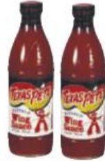
Texas Pete Buffalo Wing Sauce 12 oz. btl.