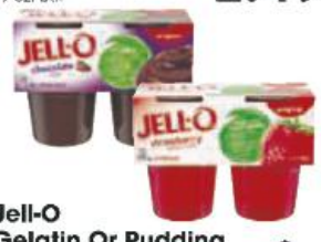
Jell-O Gelatin Or Pudding Selected Varieties 4 pk. 12.5-15.5 oz. pkg.