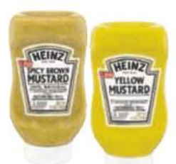
Heinz Mustard Yellow Or Spicy Brown 14 oz. btl.