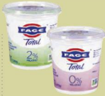
Fage Total Greek Yogurt Selected Varieties 32 oz. ctn.