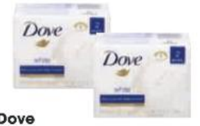
Dove Bath Soap Selected Varieties 2 ct. pkg.