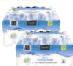
Essential Everyday Purified Drinking Water 24 pk. 16.9 oz. btl.