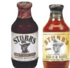
Stubb's Bar-B-Q Sauce Selected Varieties 18 oz. btl.