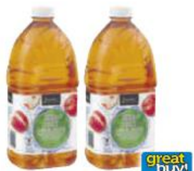
Essential Everyday Apple Juice Regular Or Light 64 oz. btl.