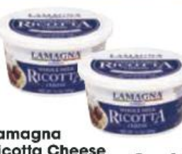
Lamagna Ricotta Cheese Whole Milk 15 oz. ctn.