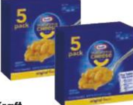
Kraft Macaroni & Cheese Dinner The Original 5 ct. 7.25 oz. boxes