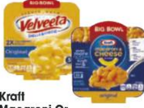
Kraft Macaroni Or Velveeta Shells & Cheese Big Bowl Selected Varieties 3.5-5 oz. pkg.