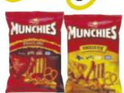
Frito Lay Munchies Selected Varieties - 8-11.04 oz. bag