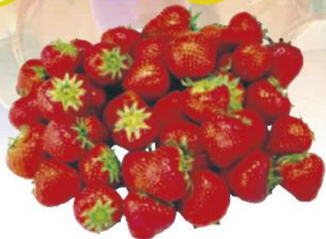
Red Ripe Strawberries 1 lb. ctn.