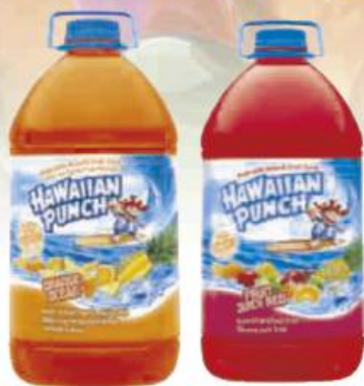
Hawaiian Punch Juice Drinks Selected Varieties 128 oz. jug