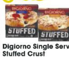
DiGiorno Single Serve Stuffed Crust Pizza Selected Varieties 8.5-9.2 oz. pkg.