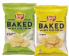
Lay's Baked Potato Chips Selected Varieties - 6.25-7.625 oz. bag