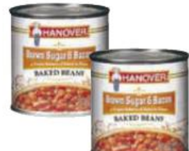
Hanover Baked Beans Brown Sugar & Bacon 16 oz. can