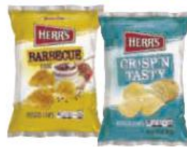
Herr's Potato Chips Selected Varieties - 7.75-8 oz. bag