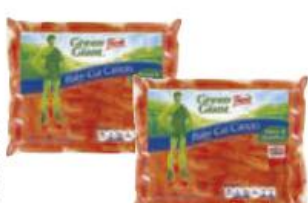
Green Giant Baby Cut Carrots 1 lb. bag