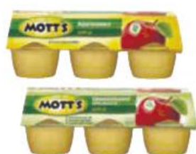
Mott's Applesauce Selected Varieties 6 ct. 3.9-4 oz. cups