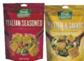
Fresh Gourmet Croutons Selected Varieties - 5 oz. pkg.