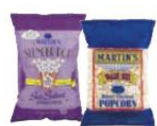
Martin's Value Size Popcorn Selected Varieties - 7-10.5 oz. bag