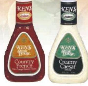
Ken's Steak House Salad Dressing Selected Varieties 16 oz. btl.