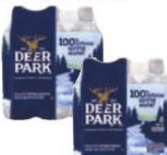
Deer Park Natural Spring Water 6 pk. 23.7 oz. btl.