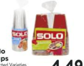
Solo Cups Selected Varieties 24-150 ct. pkg.