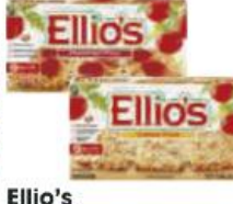
Ellio's Pizza Selected Varieties 14.76-19.64 oz. box