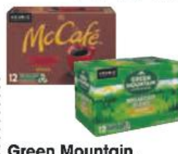
Green Mountain, Donut Shop Or McCafe K-Cups Coffee Selected Varieties 10-12 ct. box