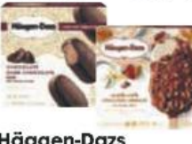
Häagen-Dazs Ice Cream Bars Selected Varieties 3-6 ct. pkg.