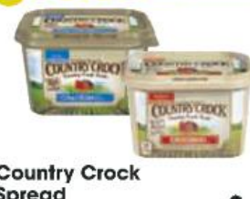
Country Crock Spread Selected Varieties 15 oz. ctn.