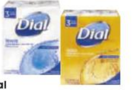
Dial Bar Soap Selected Varieties 3 ct. 4 oz. bar