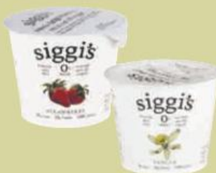
Siggis Icelandic Skyr Yogurt Selected Varieties - 4.4-5.3 oz. ctn.