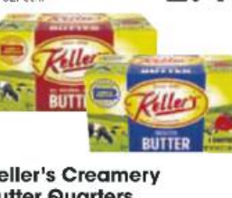
Keller's Creamery Butter Quarters Salted Or Unsalted 16 oz. pkg.