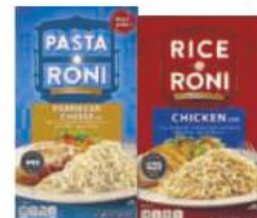
Rice A Roni Or Pasta Roni Selected Varieties 4.6-7.2 oz. box Or 1.97-2.25 oz. cup