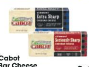
Cabot Bar Cheese Selected Varieties 8 oz. pkg.