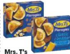
Mrs. T's Pierogies Selected Varieties 12.84-16 oz. box