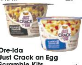
Ore-Ida Just Crack an Egg Scramble Kits Selected Varieties 2.25-3 oz. cup