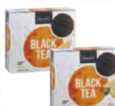
Essential Everyday 100% Natural Tea Bags 100 ct. box