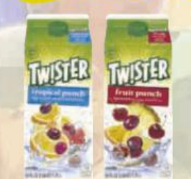
Tropicana Twister Fruit Beverage Selected Varieties - 59 oz. ctn.