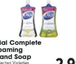
Dial Complete Foaming Hand Soap Selected Varieties 7.5 oz. btl.