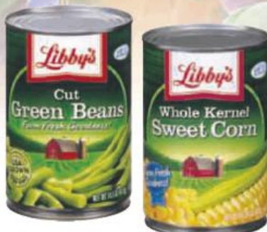
Libby's Vegetables Selected Varieties 14.5-15 oz. can