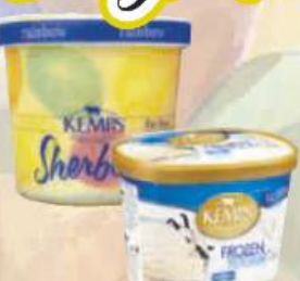
Kemp's Sherbet Or Frozen Yogurt Selected Varieties - 48-54 oz. ctn.