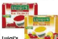
Luigi's Real Italian Ice Selected Varieties 24-36 oz. box