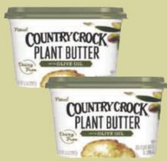
Country Crock Plant Butter Avocado Or Olive Oil 10.5 oz. tub