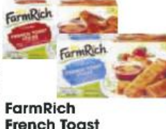
FarmRich French Toast Sticks Original Or Cinnamon 12 oz. box