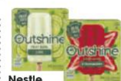
Nestle Outshine Bars Selected Varieties 6 pk. 14.7-15 oz. pkg.