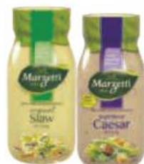
Marzetti Salad Dressing Selected Varieties - 12-13 oz. jar