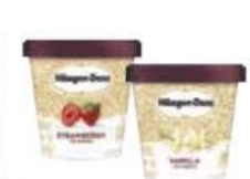
Häagen-Dazs Ice Cream Selected Varieties 14 oz. ctn.