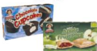
Little Debbie Family Packs Selected Varieties - 12-18 oz. pkg.