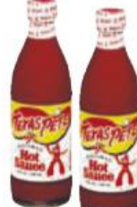
Texas Pete Hot Sauce Original 12 oz. btl.