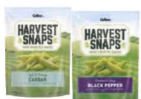
Harvest Snaps Green Pea Snack Crisps Selected Varieties - 3-3.3 oz. pkg.