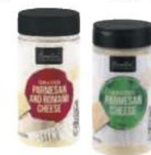
Essential Everyday Parmesan Cheese Selected Varieties 8 oz. ctn.