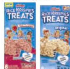
Kellogg's Rice Krispies Treats Selected Varieties 8 ct. box