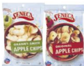
Seneca Apple Chips Selected Varieties - 2.5 oz. bag