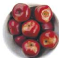
Red Delicious Apples 3 lb. bag