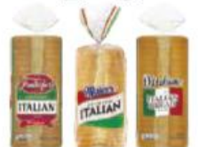
Maier's, Freihofer's Or D'Italiano Italian Bread Selected Varieties - 16-20 oz. loaf