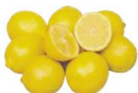
Large Lemons Fresh