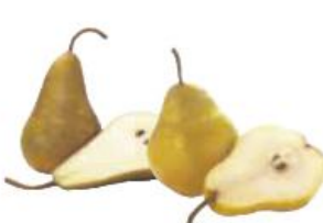
Bartlett Or Bosc Pears Premium