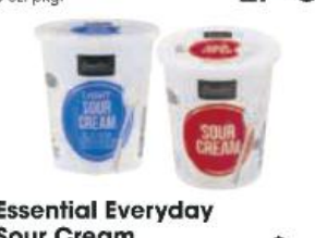
Essential Everyday Sour Cream Original Or Light 16 oz. tub