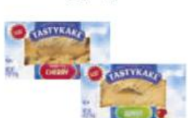
Tastykake Pies Or Pecan Swirls Selected Varieties - 4-4.5 oz. pkg.