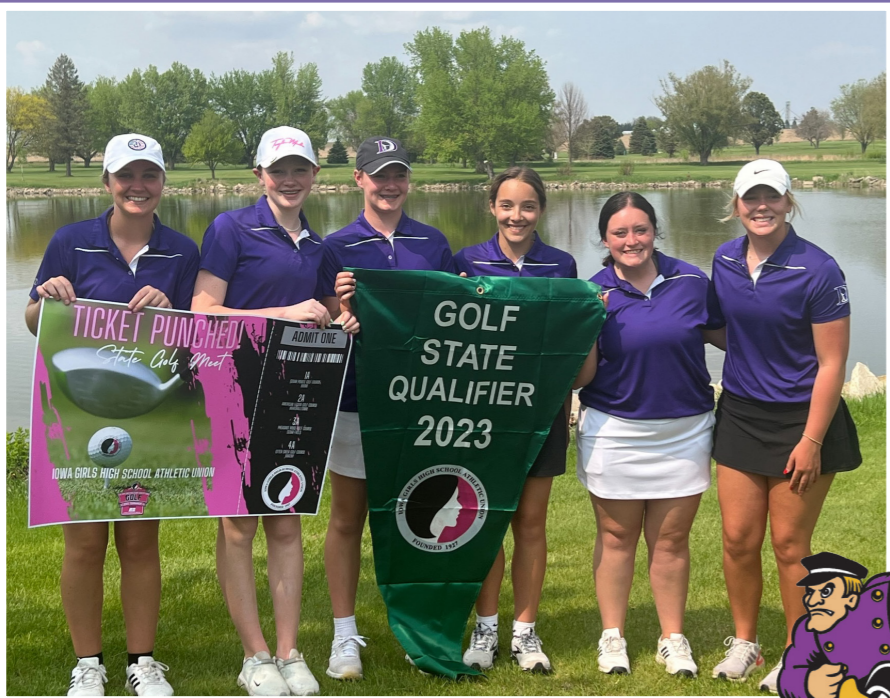
MOC-Floyd Valley girls golf