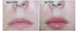
Enhance your lips with Juvederm