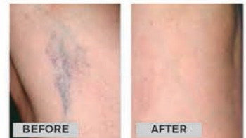
Clear legs in as little as 6-8 sessions