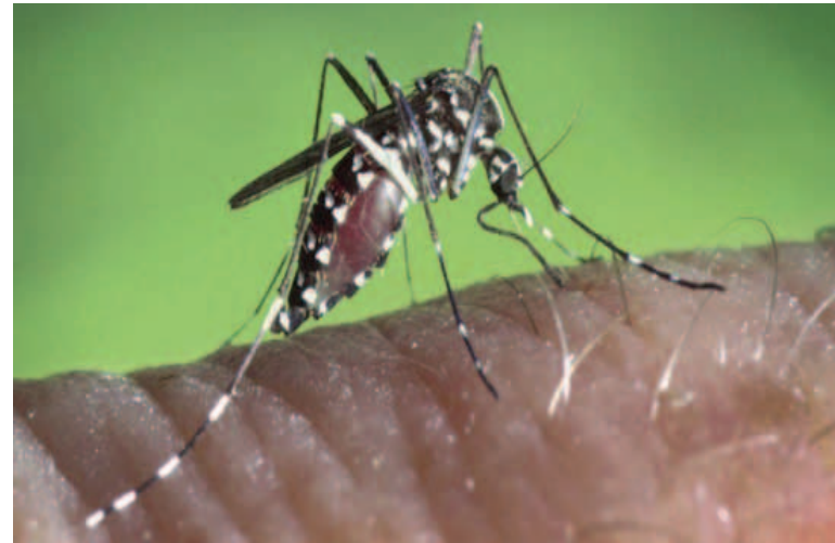
The Asian Tiger is Alabama's most common mosquito.

And if you need any extra motivation to keep your lawn and shrubs neatly trimmed, remember that adult mosquitoes gather to rest in