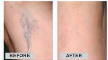
Clear legs in as little as 6-8 sessions