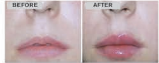
Enhance your lips with Juvederm