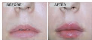
Enhance your lips with Juvederm