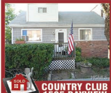
COUNTRY CLUB 1505 BAYVIEW JUST SOLD