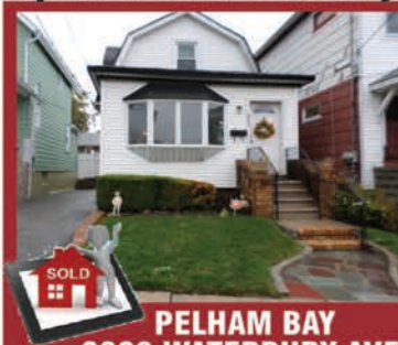
PELHAM BAY 2863 WATERBURY AVE. JUST SOLD