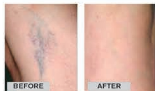
Clear legs in as little as 6-8 sessions