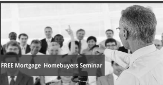
FREE Mortgage Homebuyers Seminar

White Plains Bus - Suburban Paratransit • 14 Fisher Lane, White Plains (Next to North White Plains RR Station)