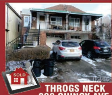
THROGS NECK 928 QUINCY AVE. JUST SOLD