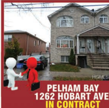
PELHAM BAY 1262 HOBART AVE. IN CONTRACT