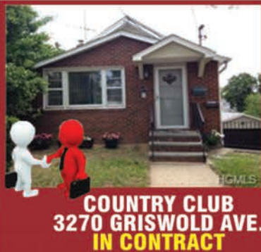
COUNTRY CLUB 3270 GRISWOLD AVE. IN CONTRACT