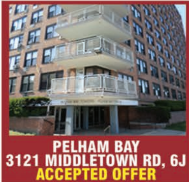
PELHAM BAY 3121 MIDDLETOWN RD, 6J ACCEPTED OFFER

VISIT OUR WEBSITE WWW.GOODLIFE.KWREALTY.COM