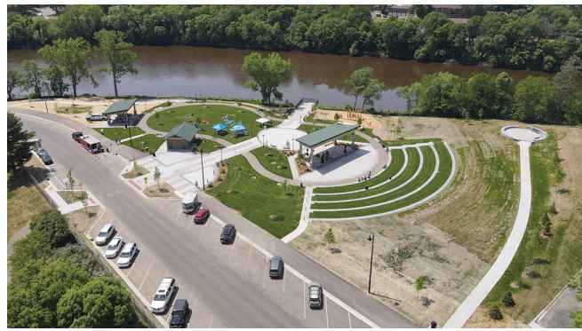
Lyman P. White Park overview. Once known as Tourist Park, the official opening was June 3.