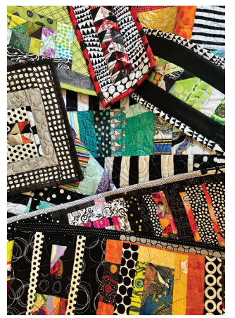
Susie Ewinger's colorful quilts will be featured at Ripple River Gallery through July 9.

'saved' and put to use." Ewinger, a South Dakota native, currently lives and creates in Choteau, MT. Ripple River Gallery is open from 10 a.m. to 5 p.m. Wednesday through Saturday; and 11 a.m. to 4 p.m. Sundays. The gallery is located five miles south of Deerwood on Highway 6, then 3 miles east of Ruttger's Bay Lake Lodge on County Road 14 to Partridge Avenue; or south of Aitkin on Highway 169 to Bennettville, then 3.2 miles west on County Road 11 to Partridge Avenue.