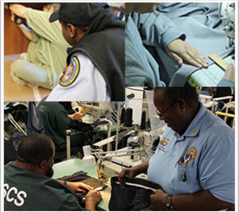
Some of the services provided by inmates for major corporations through MCE

Does this description from their catalogue sound like a state government agency? "MCE is a major supplier of meats and food products in the state of Maryland. MCE provides the highest quality beef, turkey, pork