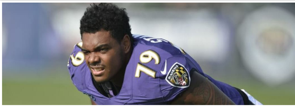
Ronnie Stanley

“Stanley attempted to make a return in 2021, but he landed on injured reserve once again almost a year later when he had to undergo season-ending ankle surgery.”