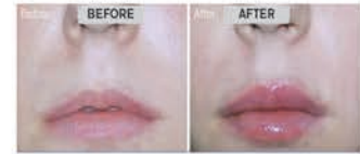
Enhance your lips with Juvederm