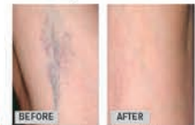
Clear legs in as little as 6-8 sessions