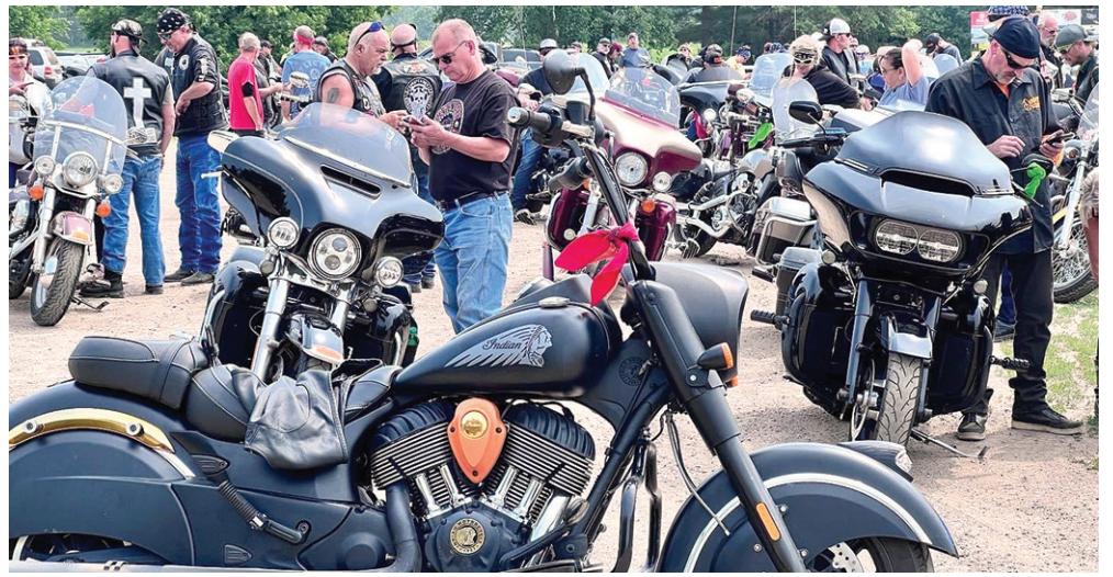
Over 60 motorcycles made an impact leaving and returning to Aitkin on June 17.