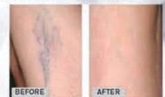
Clear legs in as little as 6-8 sessions