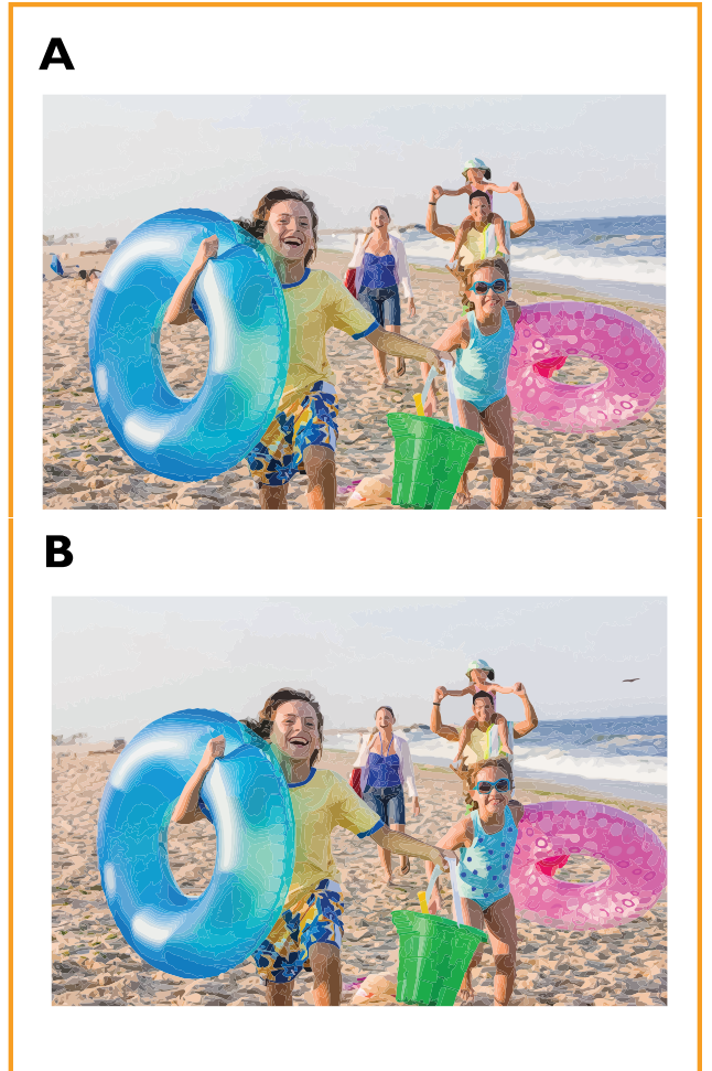
4. Woman has straps on swimsuit swimsuit 3. Missing items in background

There are four differences between Picture A and Picture B. Can you find them all?