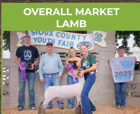
OVERALL MARKET LAMB