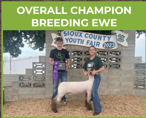
OVERALL CHAMPION BREEDING EWE