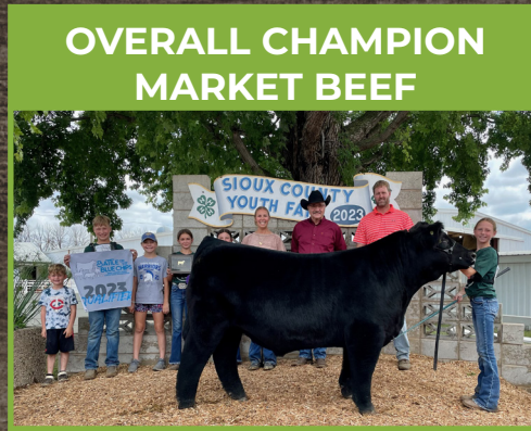
OVERALL CHAMPION MARKET BEEF