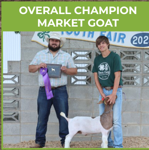
OVERALL CHAMPION MARKET GOAT