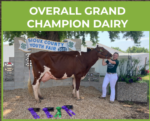
OVERALL GRAND CHAMPION DAIRY