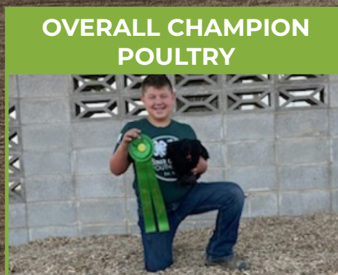
OVERALL CHAMPION POULTRY