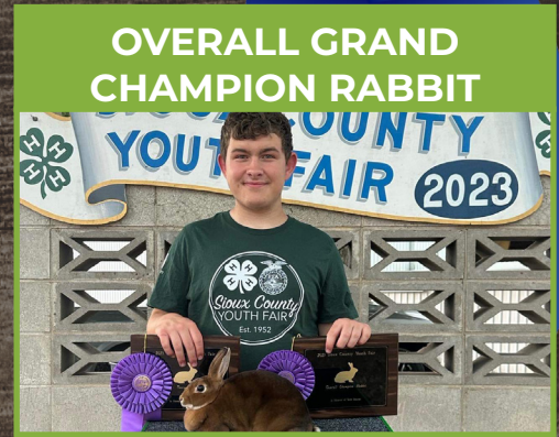
OVERALL GRAND CHAMPION RABBIT