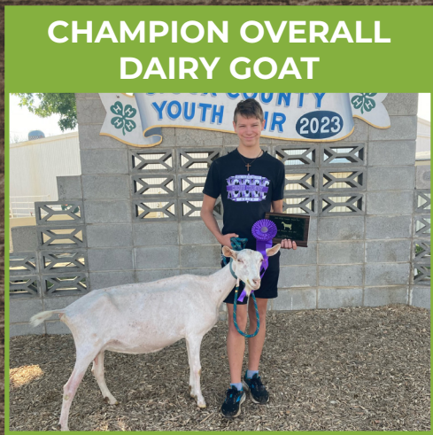
CHAMPION OVERALL DAIRY GOAT