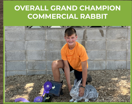
OVERALL GRAND CHAMPION COMMERCIAL RABBIT