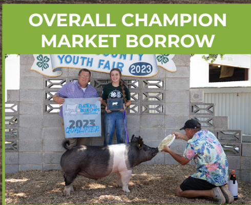
OVERALL CHAMPION MARKET BORROW