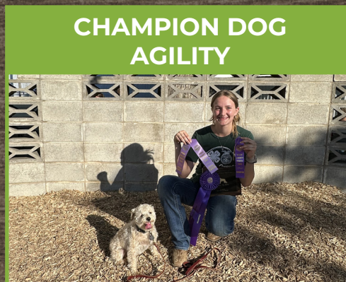
CHAMPION DOG AGILITY