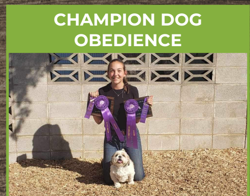
CHAMPION DOG OBEDIENCE