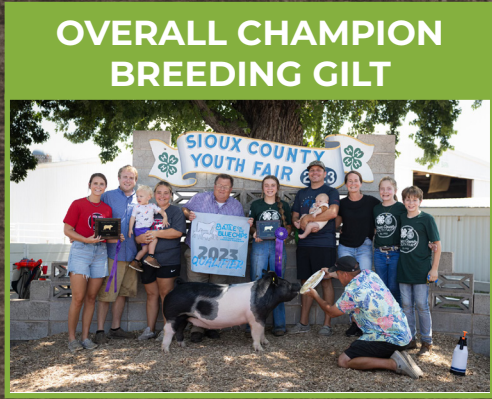
OVERALL CHAMPION BREEDING GILT