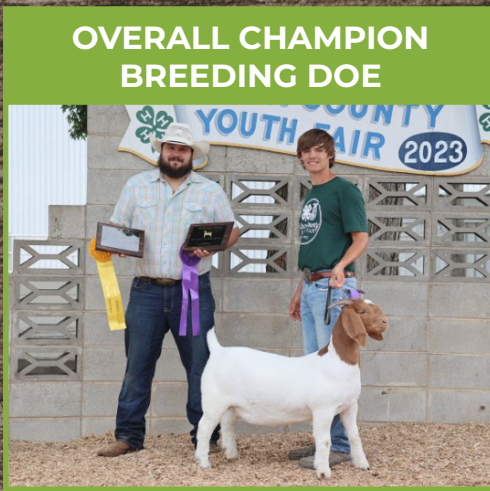
OVERALL CHAMPION BREEDING DOE