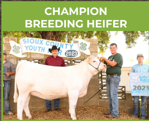
CHAMPION BREEDING HEIFER