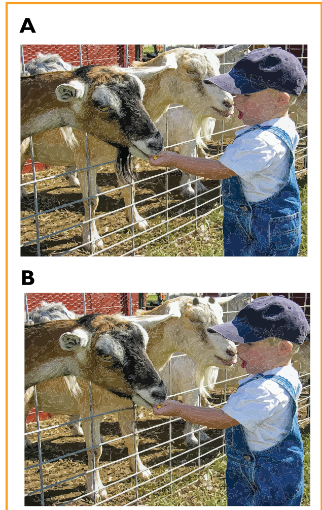
Answers: 1. More hair sticking out of cap. 2. Boy's pocket is missing. 3. Darker goat's beard is missing. 4. Lighter goat has horns

What's the Difference? There are four things different between Picture A and Picture B. Can you find them all?