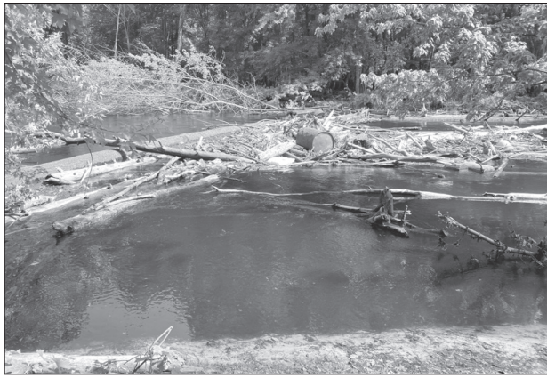
Image of the debris obstruction blocking a portion of the Saco River.

FRYEBURG AND BROWNFIELD, ME (July 28, 2023) – The Maine Warden Service is urging canoeists and kay-