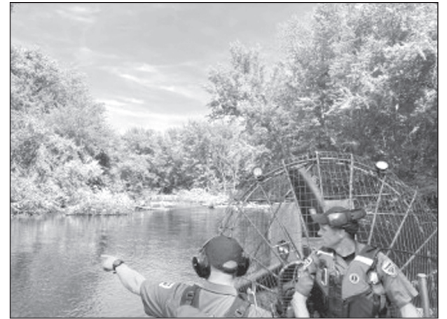
Game Wardens used an airboat to visit and assess the site.

The Maine Warden Service encourages all paddlers to always wear their lifejackets when in a canoe, kayak and paddleboard, and to never paddle alone. Additional safety