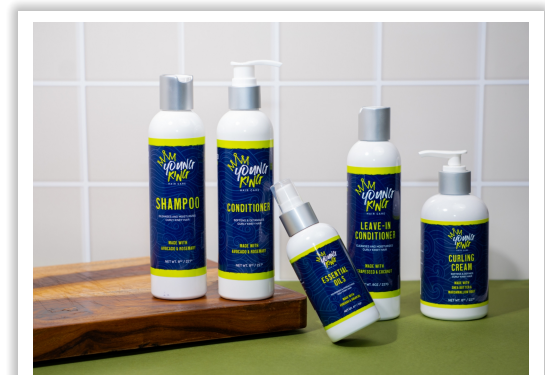
The Young King Hair Care Core Collection. Young King Hair Care is plant-based and boy-inspired.

Learn more about Young King Hair Care by visiting https://youngkinghaircare.com . Products are also sold at Target, Walmart and Amazon.