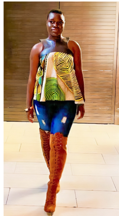
A model wearing a top made from remnants of leather combined with authentic Vilisco fabric to create a contemporary African-inspired look.

“I’ve been an artist and fashion aficionado since I was a child,” she said.