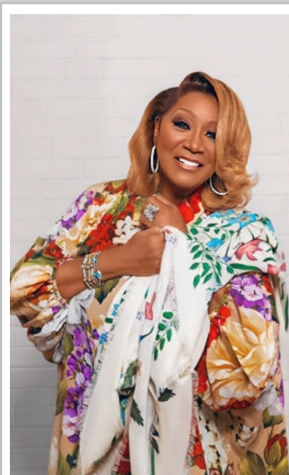
Patti LaBelle

More than 25 years ago, I collapsed onstage while performing. I had no idea what was happening, but that night in the hospital, when I was diagnosed with Type 2 diabetes, my life was forever changed.