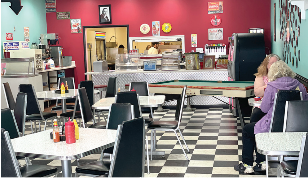
Big Tom's Diner, a 50s-era themed restaurant with poodle skirts, jukebox and milkshakes, opened in early June. It is in the former Birchwood Café location on Minnesota Avenue in downtown Aitkin.