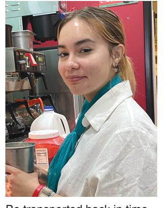
Be transported back in time as your waitress makes your milkshake at the counter.