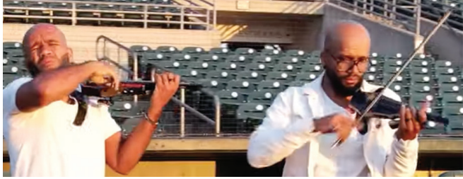
The charismatic twin brothers of B2wins from Brazil harness their violins in a blend of rock, dance, and soul.

Get ready for a sensational three-day musical extravaganza as the Central Lakes Community Performing Arts Center proudly presents the Summer Twilight Music Festival from Wednesday, to Friday, Aug. 23 to 25. This not-to-be-missed event will take place at the West Side