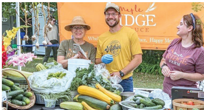
Summer Farm Festival at Clear Lake Gardens, north of Glen.