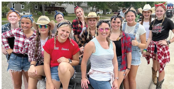
The Aitkin All Starz Dance team was a parade winner.

Avenue and at the Legion. Sunday brought breakfast, cars and planes to the Aitkin Airport with the Fly-in Drive-in and the first-ever Aitkin Summer Farm Fest at Clear Lake Gardens near Glen. Many families, groups, churches and organizations banded together to put on a fun time for local residents and visitors alike.