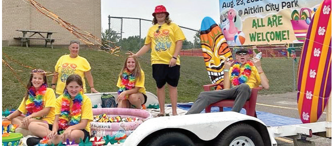
Aitkin United Methodist Church had a beachy theme.