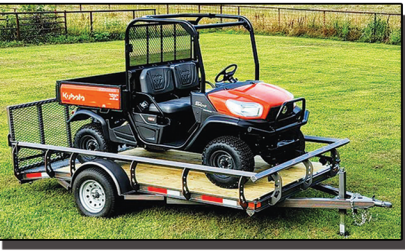
Trailer Built By Como-Pickton FFA

To Win This ... Kubota X900 Diesel w/Trailer