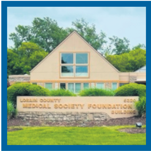
The Lorain County Medical Society Foundation Building Honoring Dr. Thomas Martin