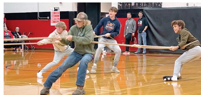
Aitkin junior versus senior boys in a tug-of-war test of strength.

As I write this, rain threatens the big game Friday night as the two football teams face off for the Stump traveling trophy on October 6. Aitkin has possession of the Stump from last year.