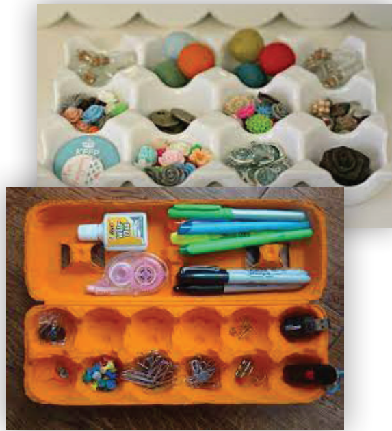
As part of its ongoing mission to educate the public about wise use of natural resources, Long Lake's team of Environmental Educators will share simple, everyday Conservation Tips that everyone, including kids, can do. If everyone makes the effort to consume resources more wisely, we can help ensure a brighter future for the planet and make life better TODAY!