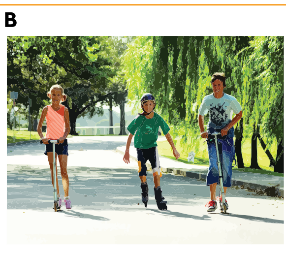
Answers: 1. Boy's shirt is green 2. Girl's shirt is orange 3. Older boy's hair is shorter 4. There is a squirrel in the grass