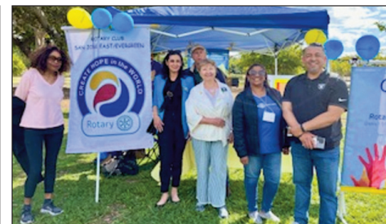
San Jose East/Evergreen Rotarians joined California State Senator Dave Cortese at his inaugural Picnic by the Lake Multicultural Festival and Resource Fair on Saturday, September 30th, 2023 at Hellyer County Park.

It's time to take a moment to thank this man and his