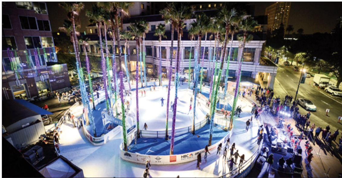
Downtown Ice will reopen this holiday season.

cur|rent (adj.) Present, topical, timely, newsworthy. (n.) Movement in a definite direction, a flow.