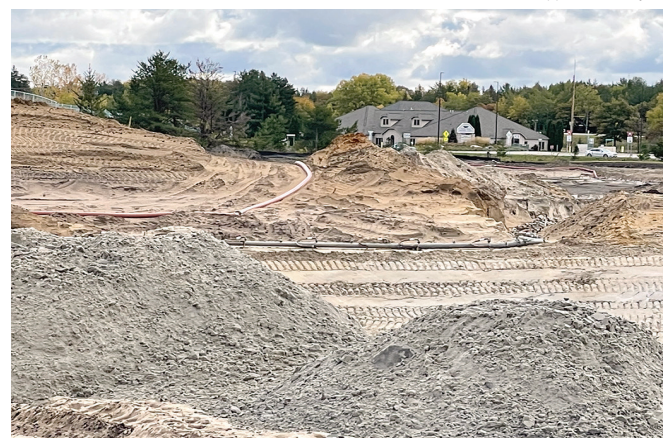
This 13-acre site off of Golf Course Drive in Baxter will filter runoff before it reaches the Mississippi River.