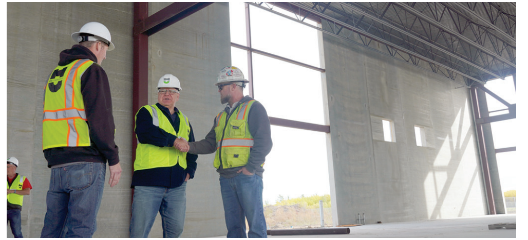
Governor Walz also visited the construction site of the new $3 million cargo hangar at the Thief River Falls Regional Airport, a project funded through the infrastructure package signed into law last session. The new building is expected to be complete in summer 2024.

To protect program integrity, recipients will also be subject to random audits.