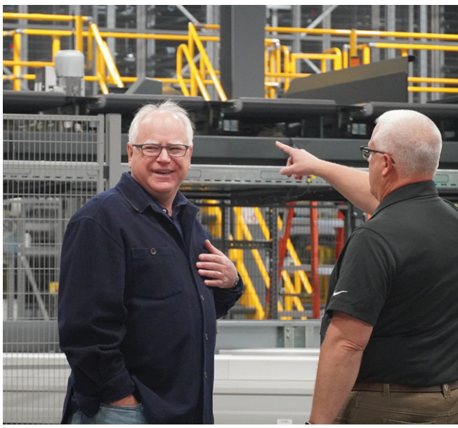
Governor Tim Walz visited Thief River Falls to highlight investments in child care and workforce development in Greater Minnesota. Governor Walz first visited DigiKey (above), an electronics manufacturer, to tour their recent 2.2 million square-foot expansion that is set to create about 1,000 new jobs in Thief River Falls.

Governor Tim Walz announced a new program that will bolster wages and benefits for Minnesota child care providers and early educators, addressing a longstanding