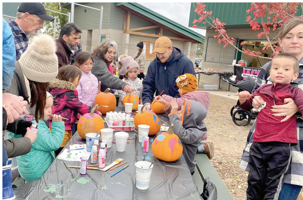
Brainerd's Great Pumpkin Festival saw windy but dry weather. It was moved to Memorial Park in Brainerd, where families enjoyed races, pumpkin activities and goodies by the Brainerd Women of Today and Ya Sure Kumbucha. Above families have fun painting pumpkins at Brainerd's Great Pumpkin Festival.