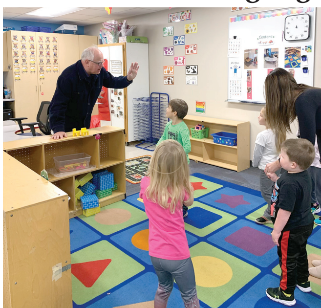
Governor Tim Walz visited Warrior Early Learning in Baxter on Tuesday, Oct. 17, as part of his statewide tour

highlighting investments made in pre-K this year. Because of this legislation, 9,000 children across the