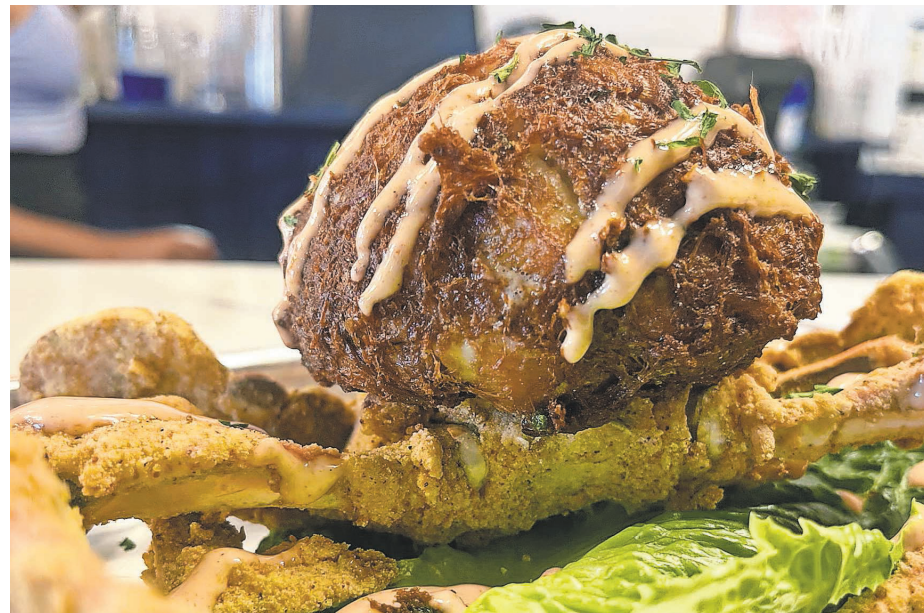
The Crab Crawler, a Maryland fried crab cake topped on a deep fried Maryland blue crab is a featured item at The Crazy Crab.