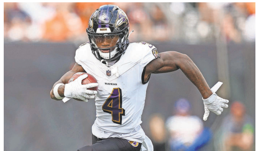
Zay Flowers

Flowers' touchdown was the one time the Ravens scored while in the red zone. He showed great maturity as a receiver by uncovering himself and finding an open area where Lamar Jackson could find him.