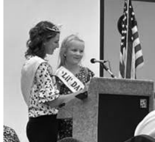
Dairy Princess and the Lil Miss

I hope you enjoyed our Fall Banquet! We hope to see you at our Spring Banquet: April 5th at the Oley Fair Center