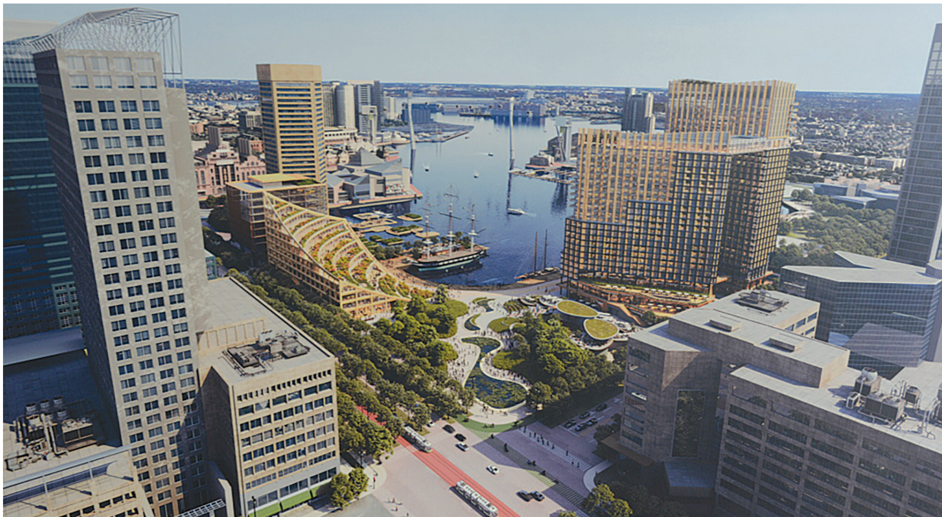
Rendering of New Harborplace.