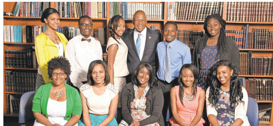
The late U.S. Rep. Elijah E. Cummings (center, rear) with a group of Elijah Cummings Youth Program (ECYP) students before 2019. High school juniors and seniors from Maryland's 7th Congressional District participate in ECYP. Over 300 fellows have been served to date.