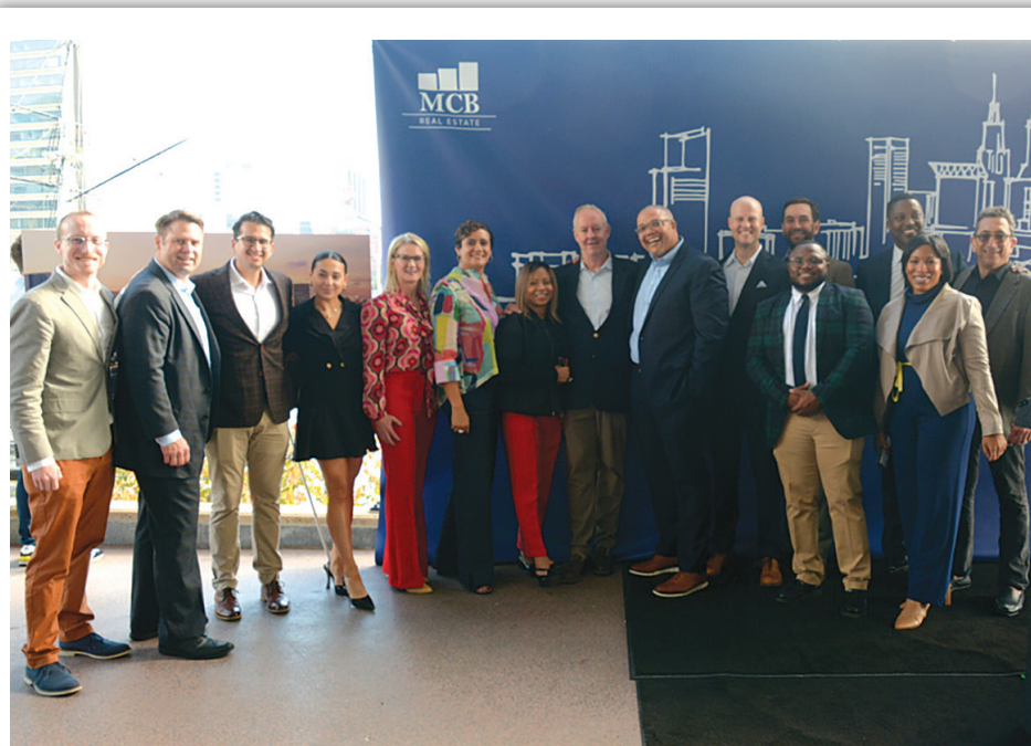
MCB Real Estate Team