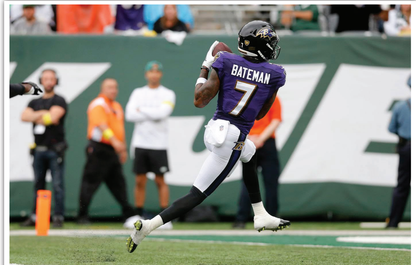
Rashod Bateman

Bateman injured his foot the following week and missed the next two games. Bateman returned against the Tampa Bay Buccaneers but left in the second quarter with a foot injury. On November 3, 2022, it was announced Bateman will undergo surgery on his foot, ending his season. He finished with 15 receptions for 285 receiving yards and two receiving touchdowns in six games.