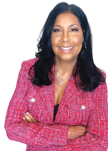
Cookie Johnson Entrepreneur, author and philanthropist