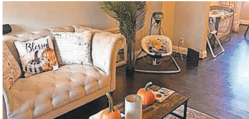
The living room at Esi's House of Hope.