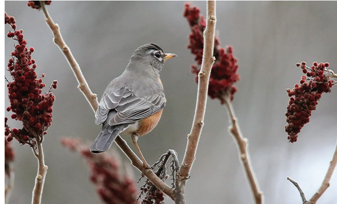
First-place winner SWCD Native Tree Photo Contest was Jennifer Quam, with a Robin perched on a Staghorn Sumac.

Crow Wing Soil and Water Conservation District (SWCD) invited photographers of all ages and abilities to submit their photos for the 2023 Native Tree Photo Contest due in October.