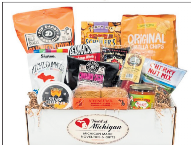
Heart of Michigan