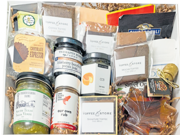
The Toffee Store

PINCONNING CHEESE CO. Pinconning pinconningcheese.com