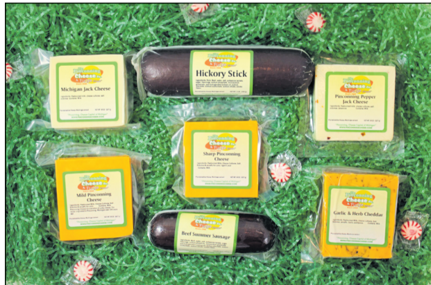
Pinconning Cheese Co.