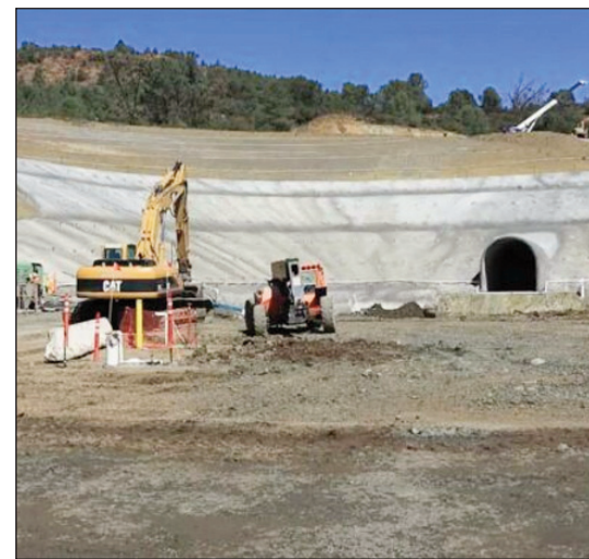
Pictured is the new concrete "soil nail wall" next to the base of Anderson Dam, which reinforces the earthen slope to support a 24-foot tunnel that will be excavated through to the inside of the reservoir.

Following this document's release, our agency