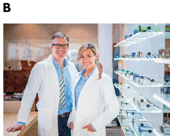
Answers: 1. Glasses on man 2. Tie on man 3. Missing glasses on shelf 4. Ponytail on woman