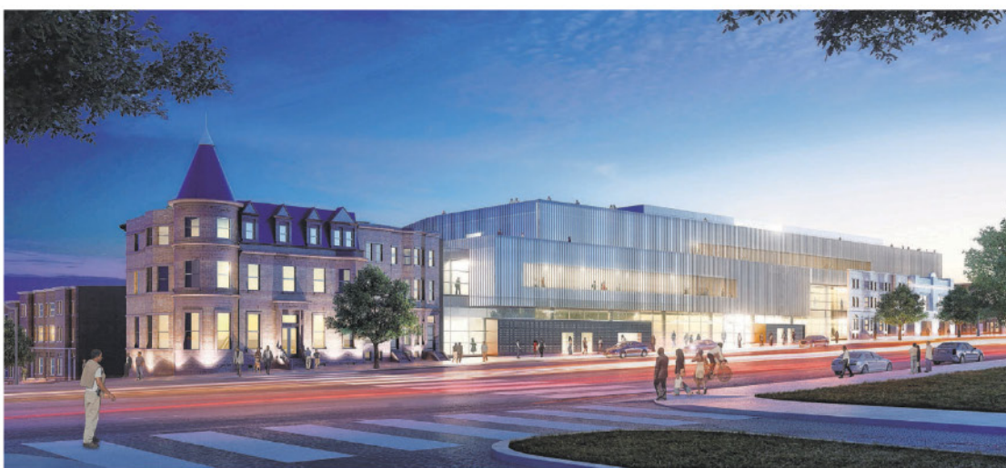
Tomorrow and Beyond: Rendering of a multi-million dollar facility spanning 1601- 1611 East North Avenue

Tickets to GBIW's 40th Anniversary Brunch are $125. For tickets and more information, visit https://www.eventbrite.com/e/40-years-and-counting-a-legacy-of-telling-our-stories-uncompromisingly-tickets-739885887607?aff=oddtcreator