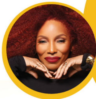
FEATURING KEYNOTE SPEAKER Stephanie Mills

Join us for an exciting celebration of older adults thriving in Baltimore City!