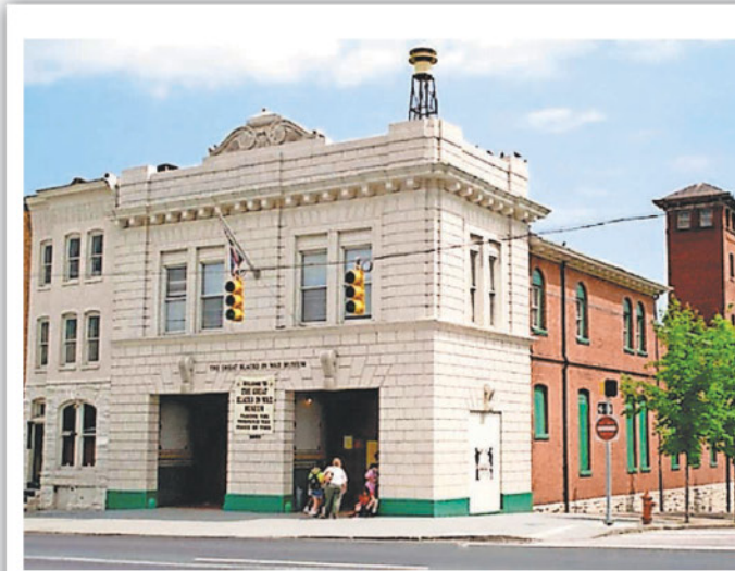
Today: The National Great Blacks in Wax Museum is currently located 1601-1603 E. North Avenue