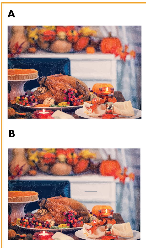
Answers: 1. Extra grapes on left 2. Missing pumpkin in back 3. Turkey wing missing 4. Handle is on drawer in back

There are four things different between Picture A and Picture B. Can you find them all?