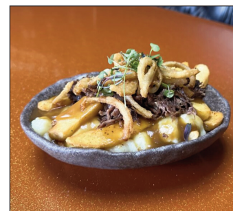
Beef Short Rib Poutine.