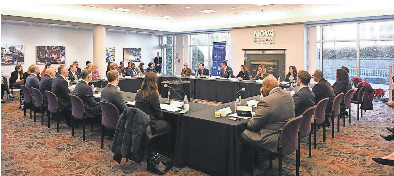
JPMorgan Chase, Greater Washington Partnership and Education Strategy Group hosted a roundtable discussion with local education and corporate leaders to discuss the TalentReady initiative which will expand access to economic opportunity for students across Washington D.C., Maryland and Virginia.