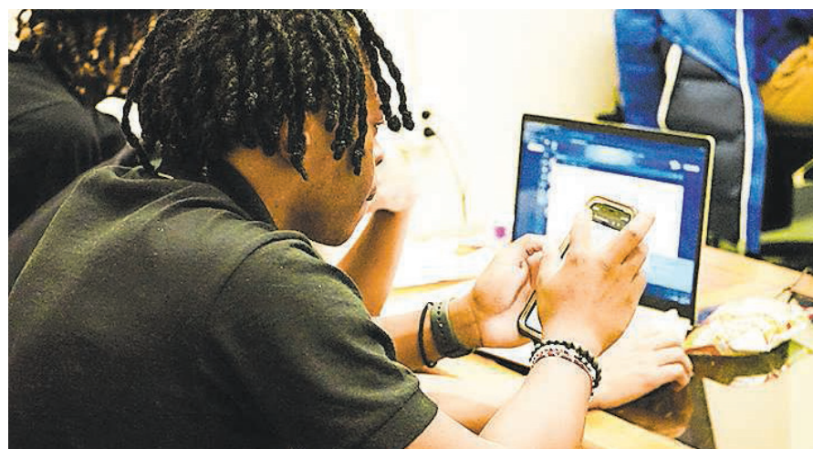
CISCO Networking Academy students from Mergenthaler Vo-Tech during the first round of the CyberPatriot competition in October 2023. Student teams participated in their second round this past month and competed in the state finals on December 8, 2023.