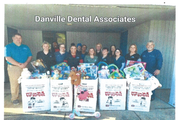
Danville Dental Associates