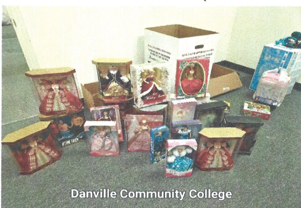
Danville Community College