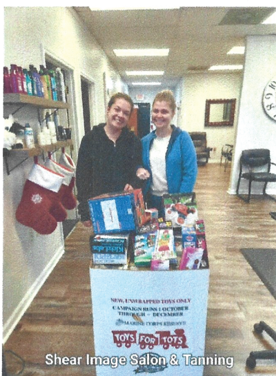
Shear Image Salon & Tanning