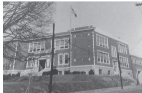
Stonewall Jackson School Danville, Virginia

Take a look back to a time when life was simpler.